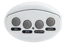
iS4 4-Function Spa-Side Remote